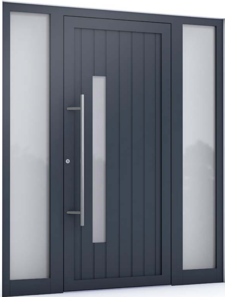
Model shown: RK 300T in RAL 7016 Anthracite Grey with optional sidelights and 1 meter long bar handle.