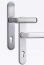
ES 2641 SAA silver or white internal lever handle with spring return