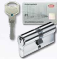
ES 2217 BKS Livius security cylinder with registration card