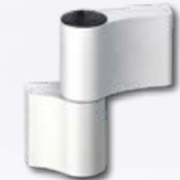
ES 2420 2 piece flag hinge in SAA Silver or White