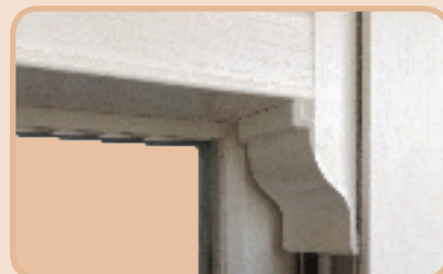
RunThru Sash Horns