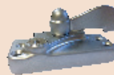
Premium Cam Catch

Available in White, Gold, Chrome and Satin