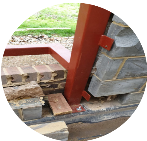
Thermally Broken Aluminium Framework