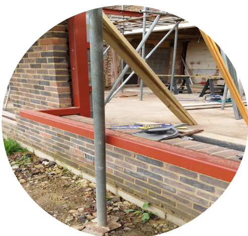
Fixing Straps (Quantity subject to size)