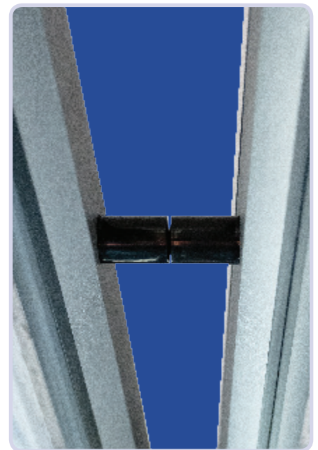
Supplied with magnetic stacking catches where required