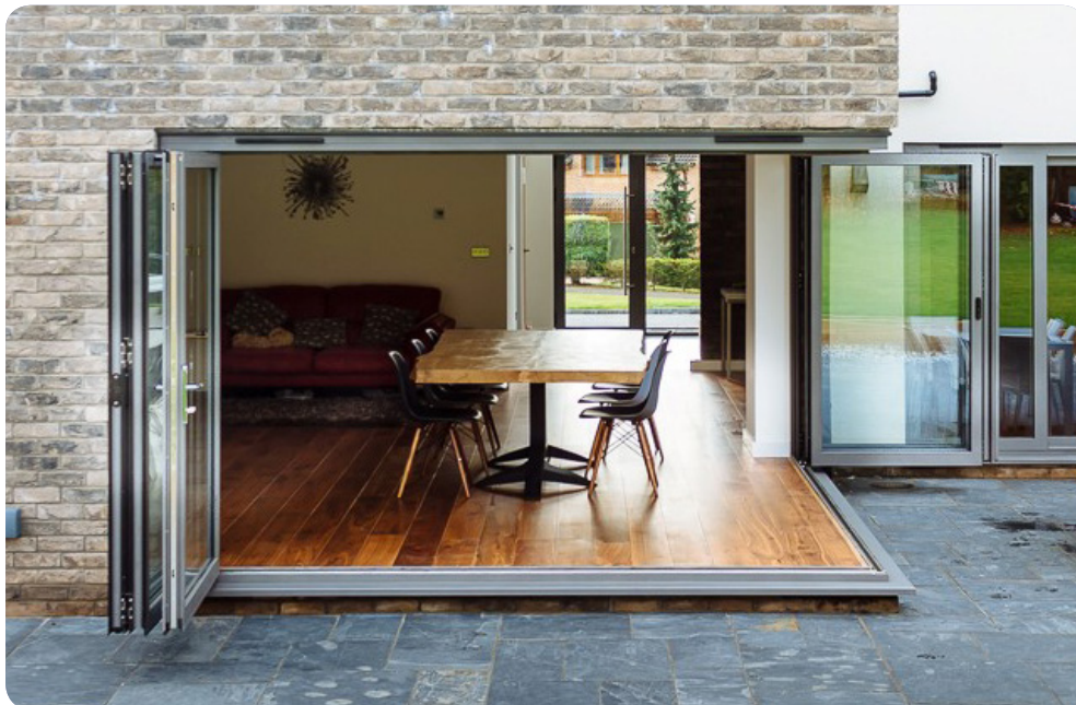
Cornerless Aluminium MultiFolding Door - Two Doors, One Aperture and No Corner Post!

Full range of Single and Dual RAL colours available