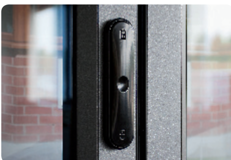
Flush line pop-out handle