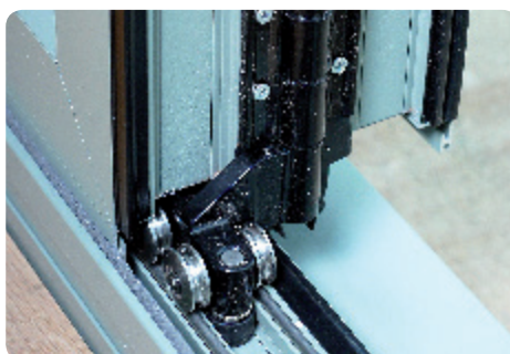
Stainless steel wheels